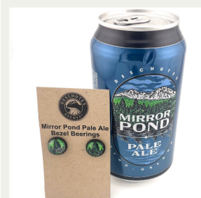
2 Pairs of Earrings (Winner's Choice)