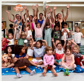
1 week of Dance Summer Camp