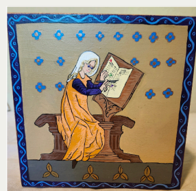
Unique Individually Painted Art Box