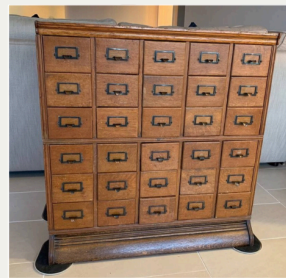
Antique Card Catalog