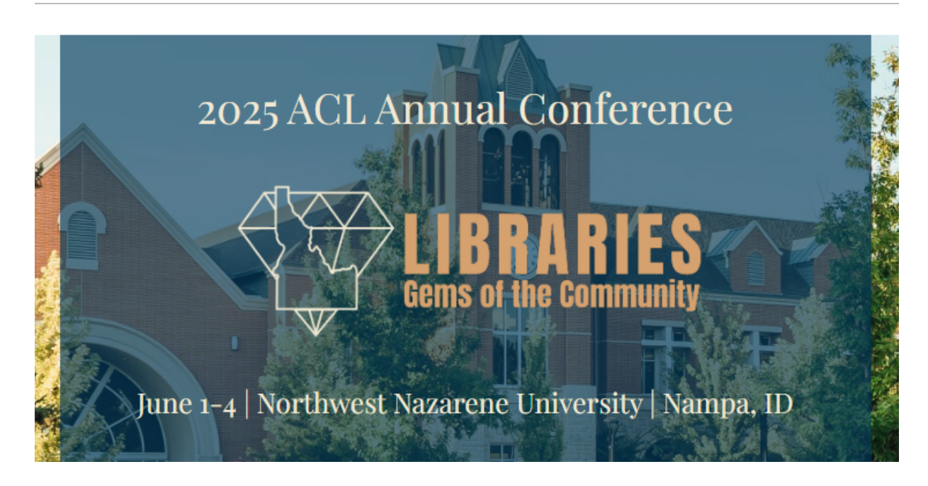
Registration Open: ACL Annual Conference

The Institute of Museum and Library Services is the only source of federal funding dedicated to libraries. Every member of Congress needs to know why libraries are not just a "nice to have," but a necessity. Tell Congress your library story: <a href="mailto:bit.ly/4iqzFqk">bit.ly/4iqzFqk</a>