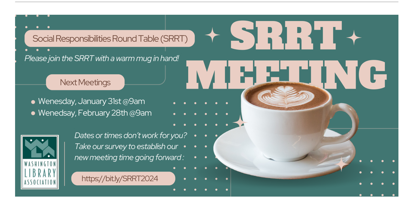
Join the First SRRT Meeting of 2024

Do you have an article ready? Email your submissions as a .doc, .docx, or Google Doc to <u>alkieditor@wla.org</u> before Tuesday, Feb. 6 . For inspiration, <u>check out past</u> <u>issues of Alki </u>. Before submitting a piece, please visit <u>alki.pubpub.org/guidelines</u> for submission requirements.