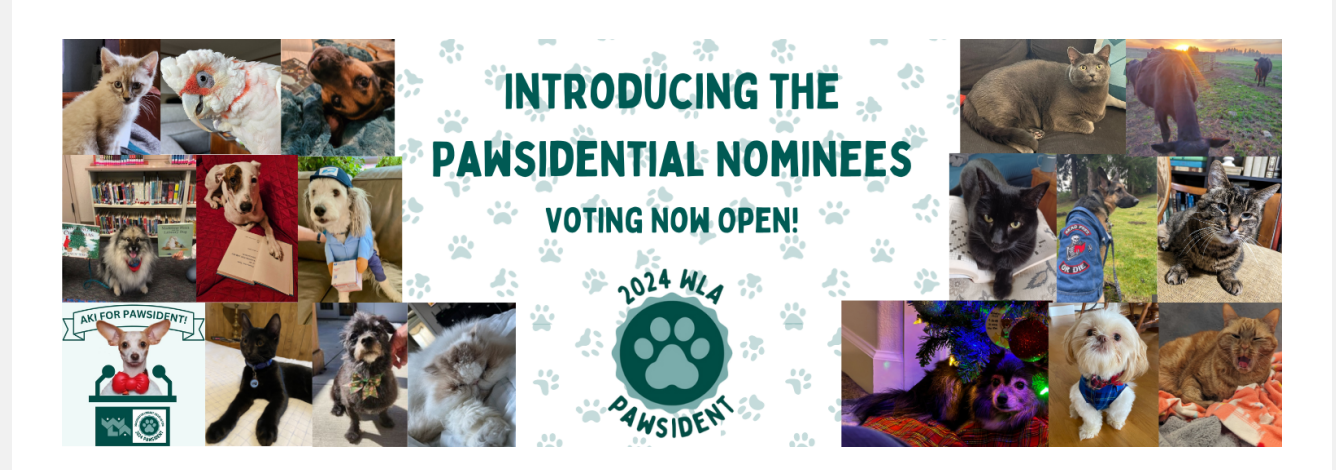
WLA Pawsident Election Fundraiser - Vote Now!

These scholarships were made possible by our conference sponsorship opportunities. If you know of an organization that'd like to make a direct impact in the WA library community, please <u>find more information</u> on our sponsor and exhibitor site.