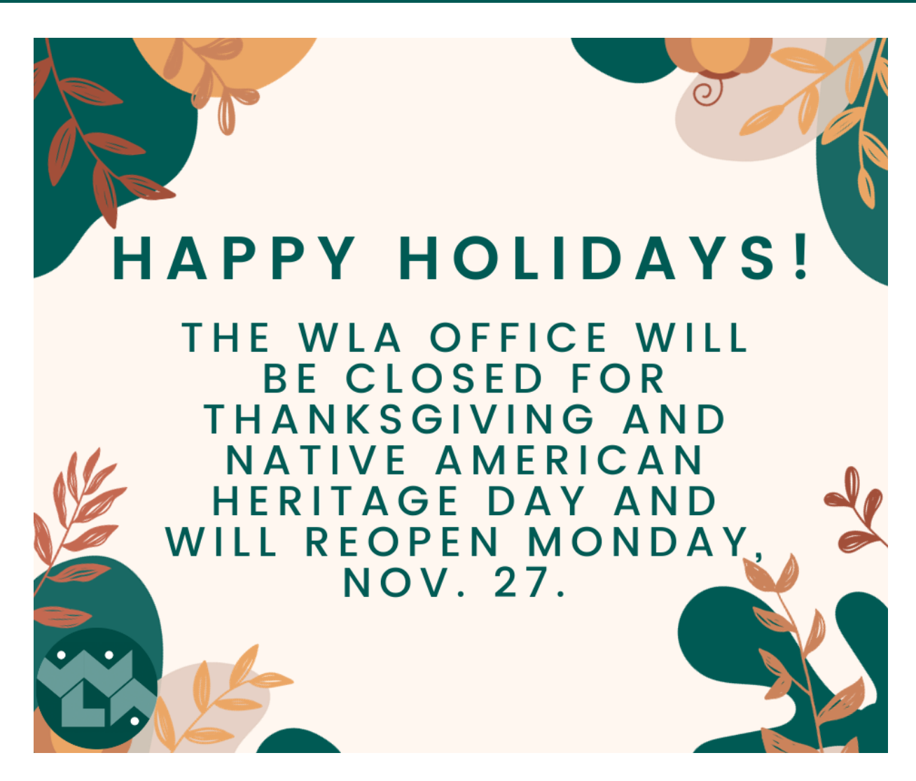
WLA Office Holiday Closure