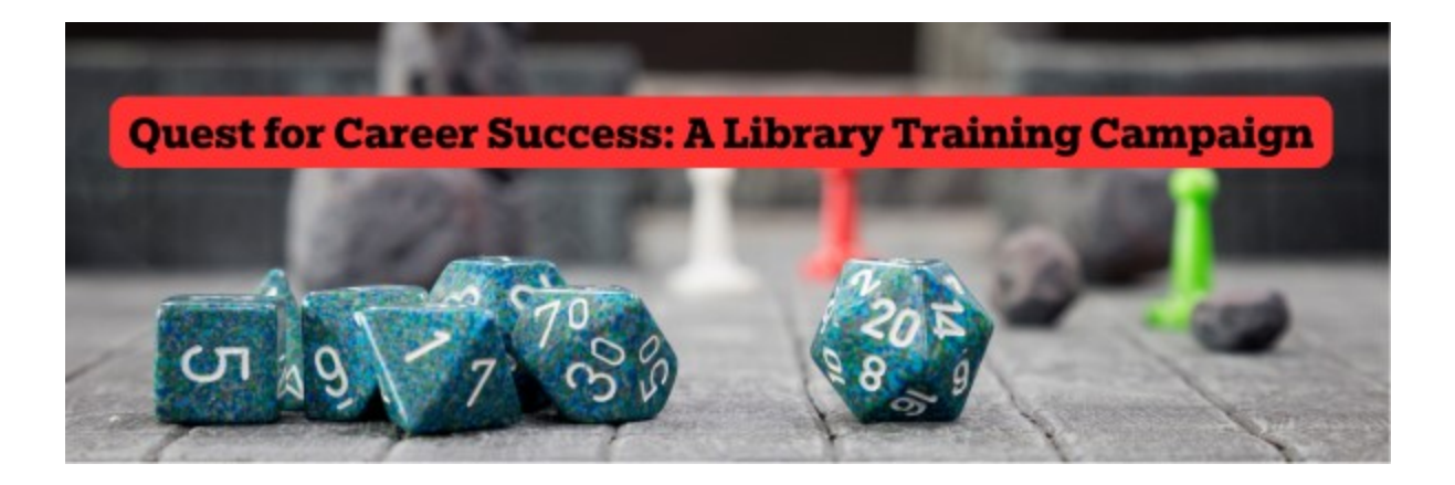
Quest for Career Success: A Library Training Campaign

The Washington State Library is excited to announce a new training series opportunity for you and your staff. Embark on an epic quest with the Quest for Career Success series, where library staff become the ultimate career guides in a role-playing adventure for job seekers! Equip yourself with powerful strategies and magical tools to help patrons level up their career skills and achieve their professional goals. Ready your gear, gather your party, and join us on this heroic journey to transform your library into a legendary career hub!