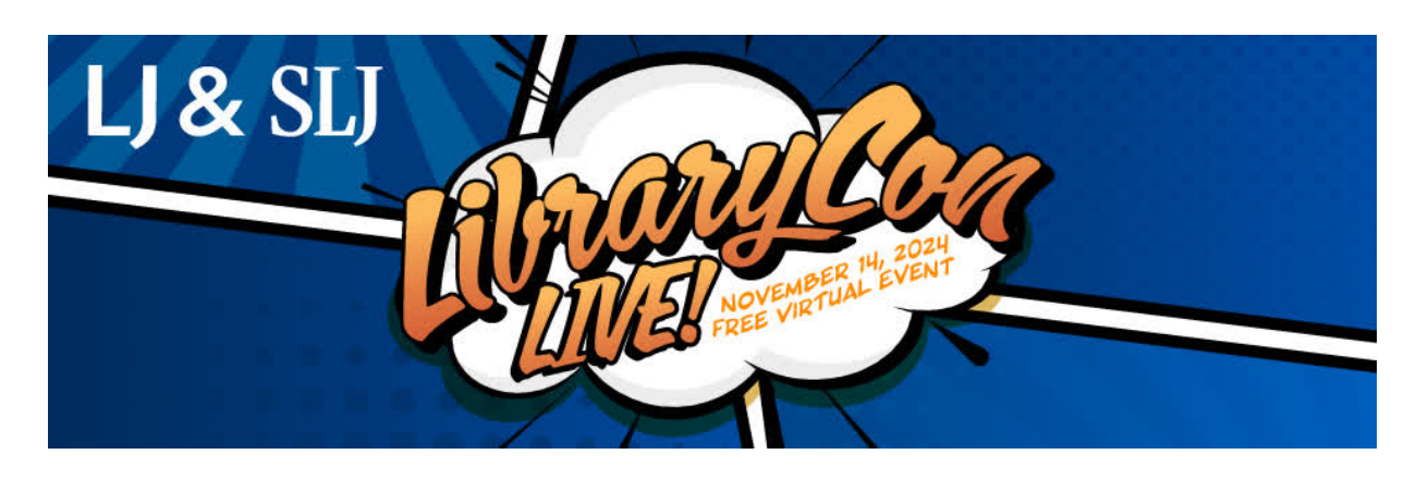
8th Annual LibraryCon Live!

Please note that you need to <u>create a user account</u> (free) to register. If you can't attend, visit the registration page to view a recording (posted a few weeks after the session is over).