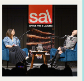
$120 gift certificate for 2 Seattle Arts & Lectures tickets