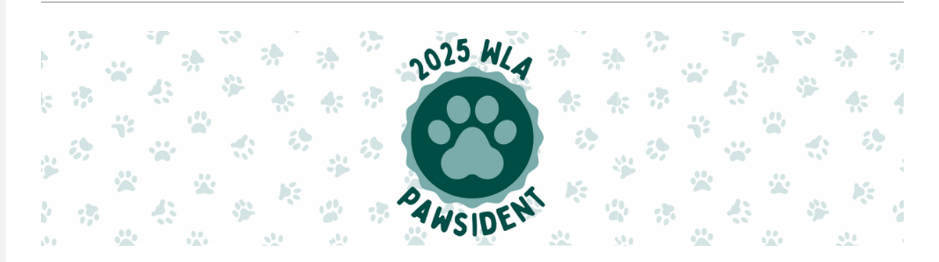
WLA Pawsident Election Fundraiser - Vote Now!

Proposals are due no later than today, Wednesday, December 4. Applicants will be notified of their proposal status by January 10, 2025 .