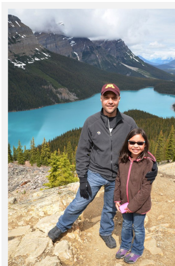
Peyto Lake, Banff National Park, Alberta CA

What is your favorite vacation spot outside of WA? My hometown: Galena Illinois