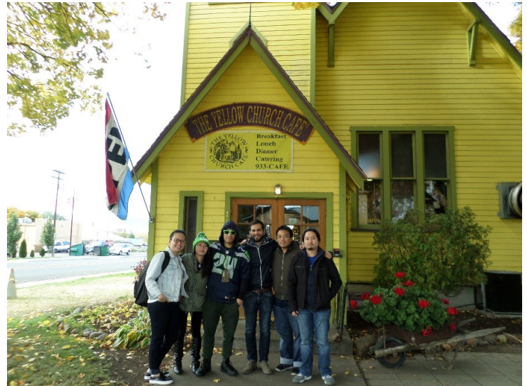
Yellow Church Café in Ellensburg, WA