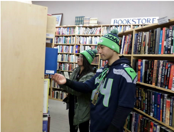
Bailey's Bibliomania Books