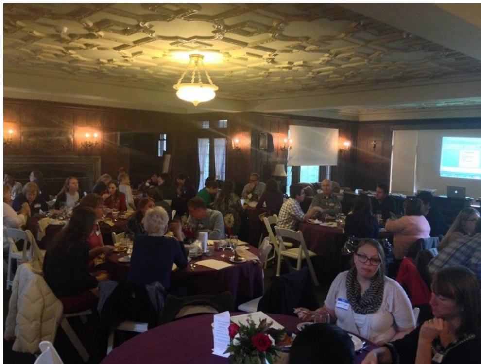
Photo of Inland InfoLit conference.

To watch a video of the Common Core panel, see the slides of seven of the presentations, or to find out more about Inland InfoLit, see the website https://inlandinfolit.wordpress.com . Or follow Inland InfoLit on Facebook at https://www.facebook.com/InlandInfoLit or Twitter at https://twitter.com/InlandInfoLit .