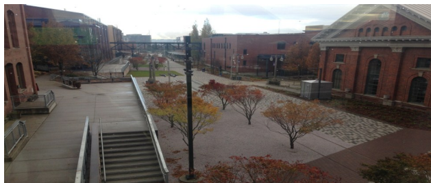
Prairie Line Trail after renovation

strip of rail line. Now, it has been transformed into a garden walkway that connects the campus and our buildings with pleasant plants, trees, colors, and function.