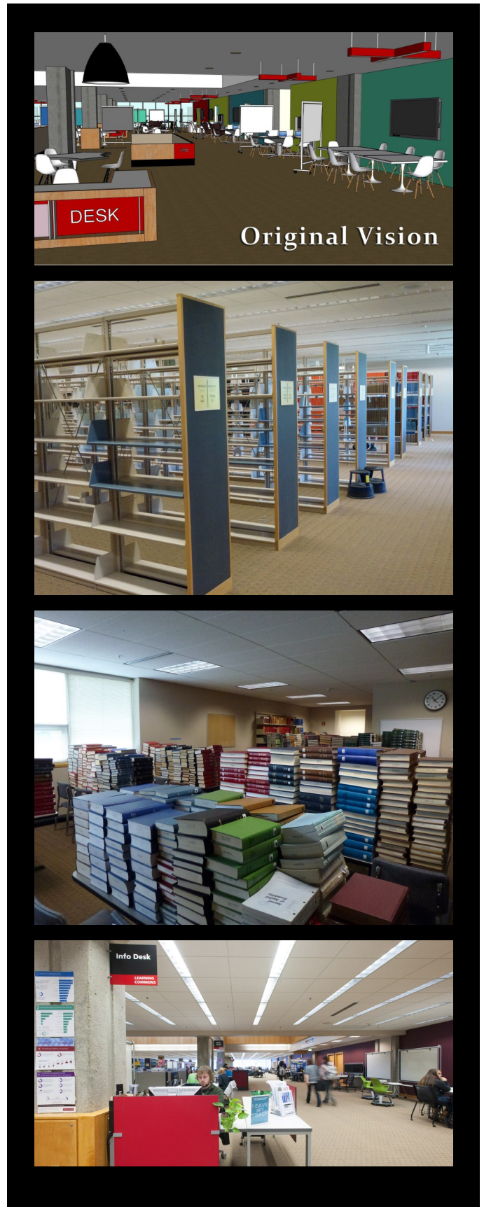
Photo Gallery, top to bottom: original vision for learning commons, removing shelving to clear space, processing removed materials, learning commons after phase I.

Check out the Learning Commons Facebook Page at: https://www.facebook.com/ewu.lc