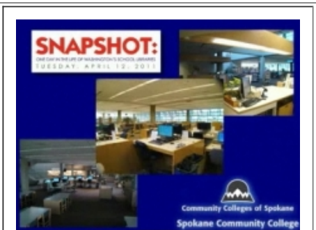
Spokane Community College

Some enterprising libraries elected to use videos to capture the day. Click on the image to view the video.