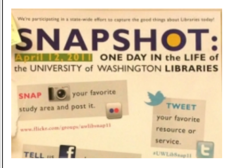
UW Libraries Seattle