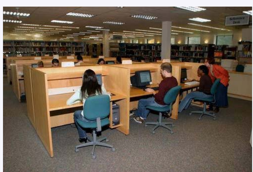
Library computers for research

Librarians also have a strong presence in the classroom. They teach classes in Research, Information Ethics and Usability in the Digital Technology and Culture Program in addition to Information Literacy