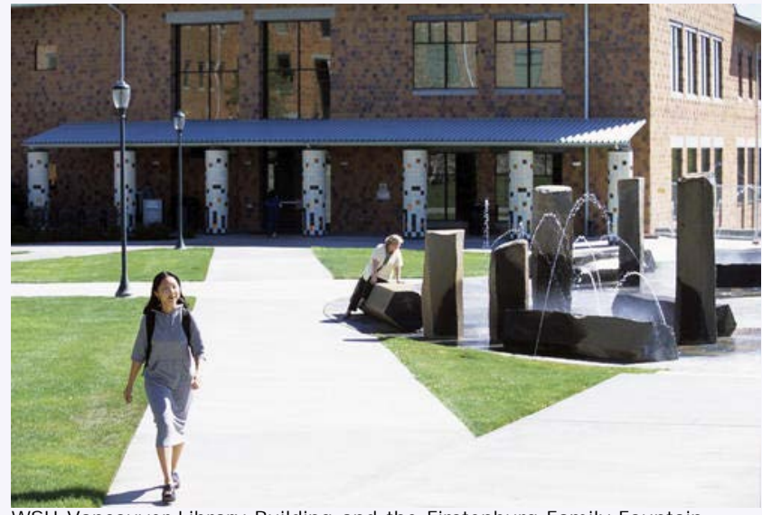
WSU Vancouver Library Building and the Firstenburg Family Fountain