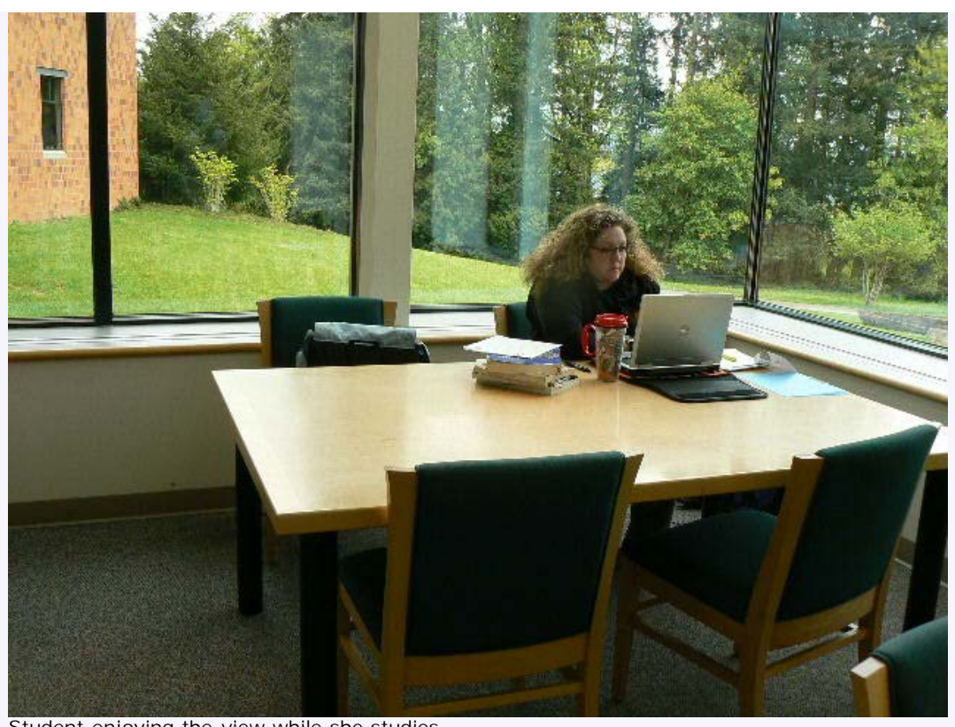
Student enjoying the view while she studies

classes in partnership with teaching faculty. This last year librarians have added teaching General Education classes to their instruction program as the campus has expanded to include first and second year students.